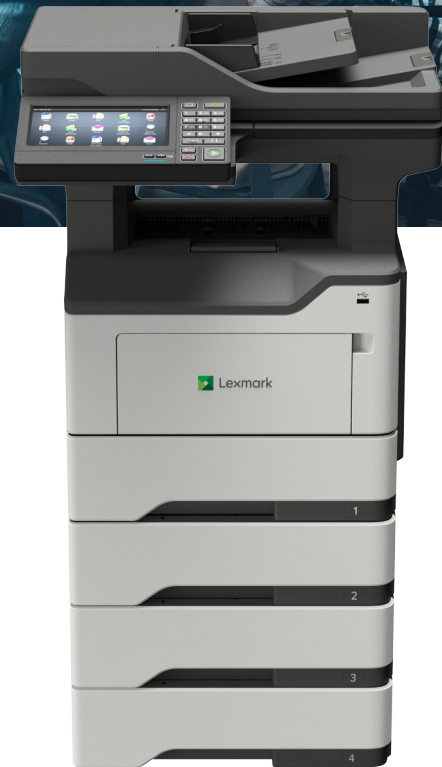
XM3250 with optional trays